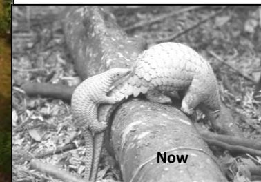
Pangolin families traversing the 2 sites

Source: NPARKS.